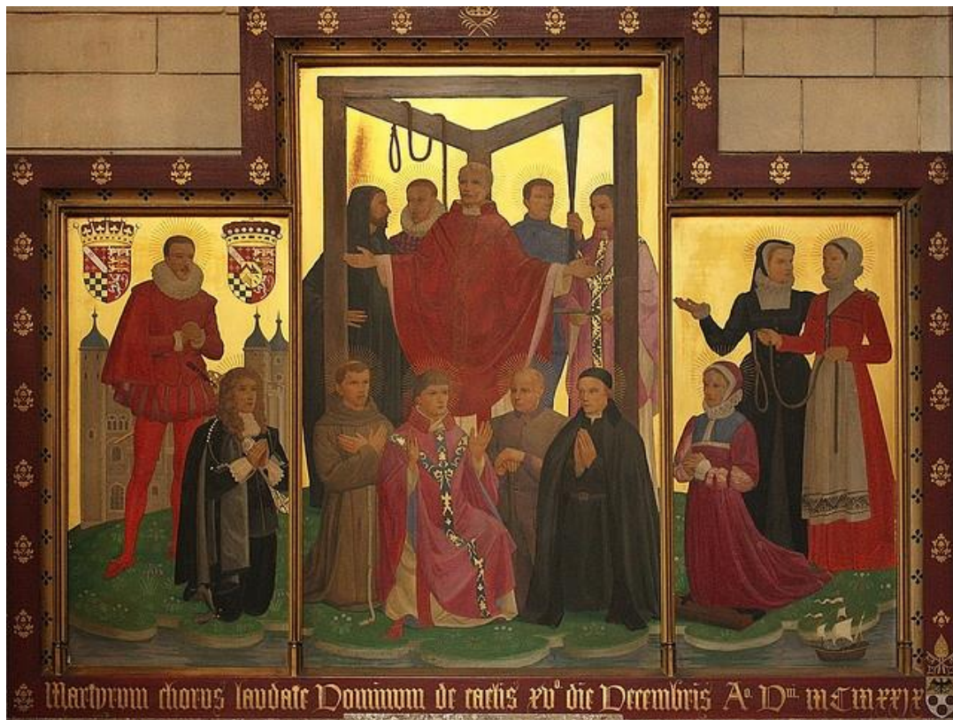
Icon of the English Martyrs at Tyburn Convent